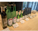
KANPAI ISESHIMA A store specializing in local sake and food from Mie Prefecture. A tasting bar is also available.