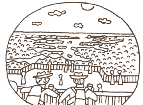
Yokoyama Tenku Café Terrace The view of Ago Bay from here is spectacular!

Yokoyama Observatory (Yokoyama Tenku Café Terrace) Yokoyama, standing 203 meters above sea level, features five observation decks and offers hiking trails with stunning natural scenery. The spectacular views from each observation deck have been awarded one star in the Michelin Green Guide Japan.