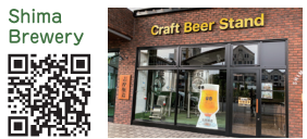
Shima Brewery A craft beer brewery in the southernmost part of Mie Prefecture, offering beers made with locally sourced ingredients.