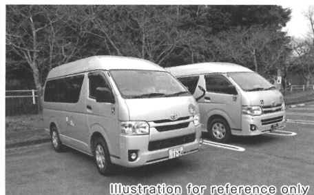
Illustration for reference only

Fukushi Taxi (Kizuna) +81 120 960 400 http://isesima-kizuna.com