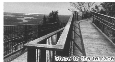
Slope to the terrace