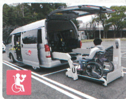
Illustration for reference only

*Fee: 1 private car for one hour at only: 3,000JPY