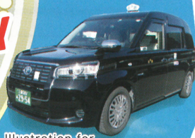
Illustration for reference only

Yokoyama View Taxi All year round! (Weekdays only)