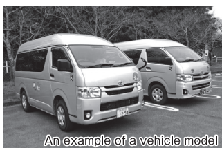
An example of a vehicle model