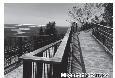
Slope to the terrace