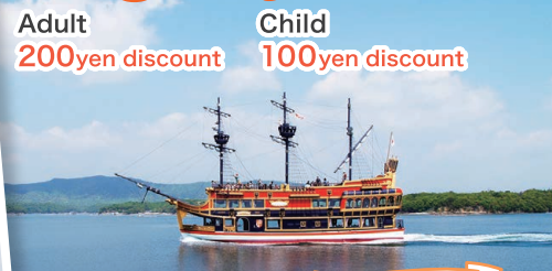
Kashikojima España Cruise

[ Inquiries ] Business hours 9:00~17:00 (Open all year round)