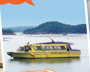
Ago bay Island hopping

If you come to Kashikojima, by all means, please visit Ago Bay.