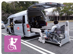
An example of a vehicle model

If you come to Kashikojima, by all means, please visit Ago Bay.